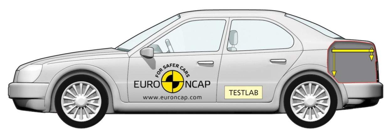
Figure 1. Setting up axis reference frame.