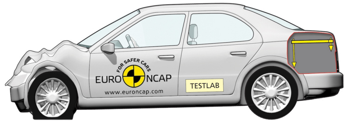
Figure 2. Re-setting axis reference frame after test.